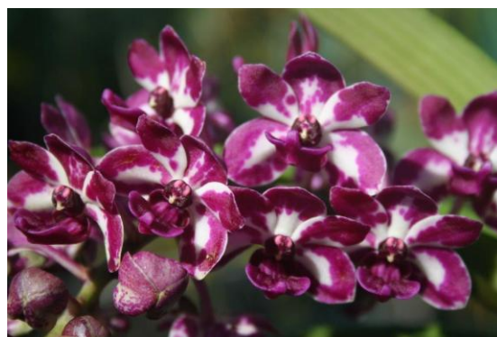
Rhynchostylis gigantea 'Illustre' x 'Peachy'

particular extra shade in my bush house. Even watering and fertiliser is needed all year, while applications of ‘flowering’ fertiliser from early in the year will help the plants to flower vigorously in winter, when it will reward you with long many-flowered sprays of brightly coloured, strongly perfumed blooms. The usual flower colour is white with scattered red or pink spots, although albino (all white), red and orange forms are now becoming more easily found. Spider mites seem drawn to this orchid and can severely damage the surface of leaves, so frequent spraying against the pest is necessary.