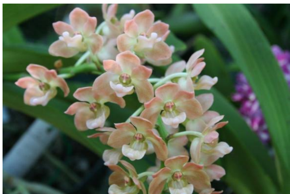
Rhynchostylis gigantea 'Orange' (1)

Rhynchostylis gigantea (Lindl.) Ridley 1896 The genus Rhynchostylis covers only three species: Rhy. coelestis , retusa and gigantea , all of which are immensely popular monopodial orchids, suited to basket cultivation because of the roaming root systems. Rhynchostylis gigantea has the most robust root system of them all, the roots often growing to finger thickness and more than a metre long once they escapes the confines of the basket. Unfortunately, the roots are fragile and highly susceptible to damage, so care must be taken when handling and transporting the plants.