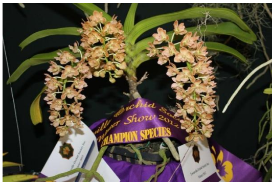
Rhynchostylis gigantea 'Orange' (3)

Rhynchostylis gigantea (Lindl.) Ridley 1896 The genus Rhynchostylis covers only three species: Rhy. coelestis , retusa and gigantea , all of which are immensely popular monopodial orchids, suited to basket cultivation because of the roaming root systems. Rhynchostylis gigantea has the most robust root system of them all, the roots often growing to finger thickness and more than a metre long once they escapes the confines of the basket. Unfortunately, the roots are fragile and highly susceptible to damage, so care must be taken when handling and transporting the plants.