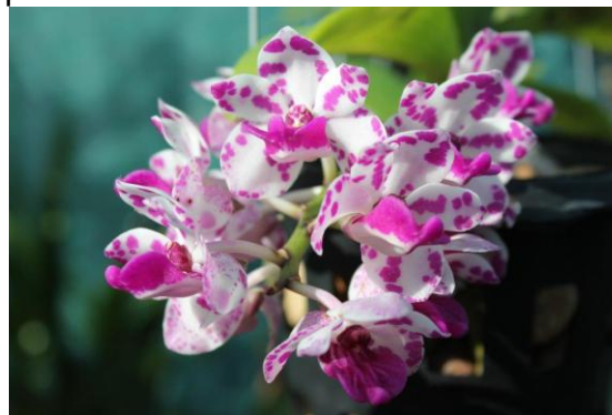
Rhynchostylis gigantea 'White-Red Spots x White' (3)

I highly recommend Rhynchostylis gigantea which is easily grown and gives great pleasure when it flowers.